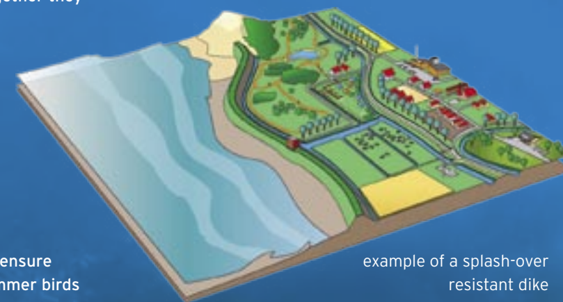
example of a splash-over resistant dike